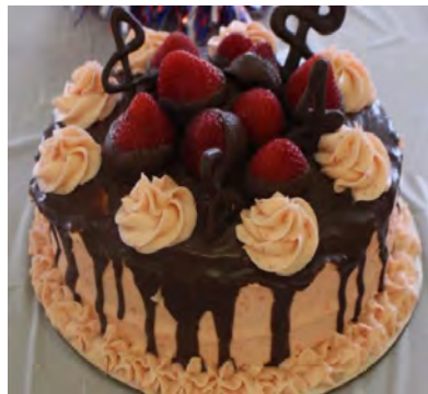
Above: 4 of the cakes that were submitted to the contest!